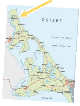
Nature on the island